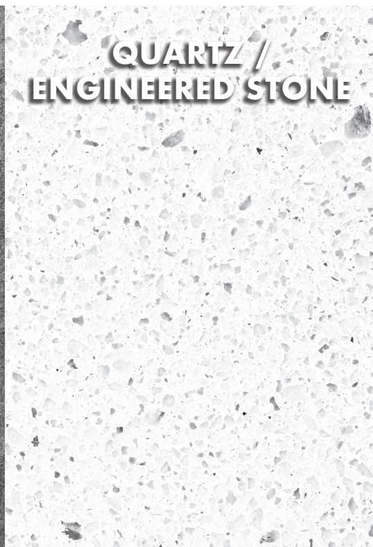
QUARTZ / ENGINEERED STONE